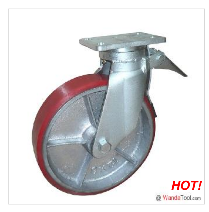
SGS Test Report Available